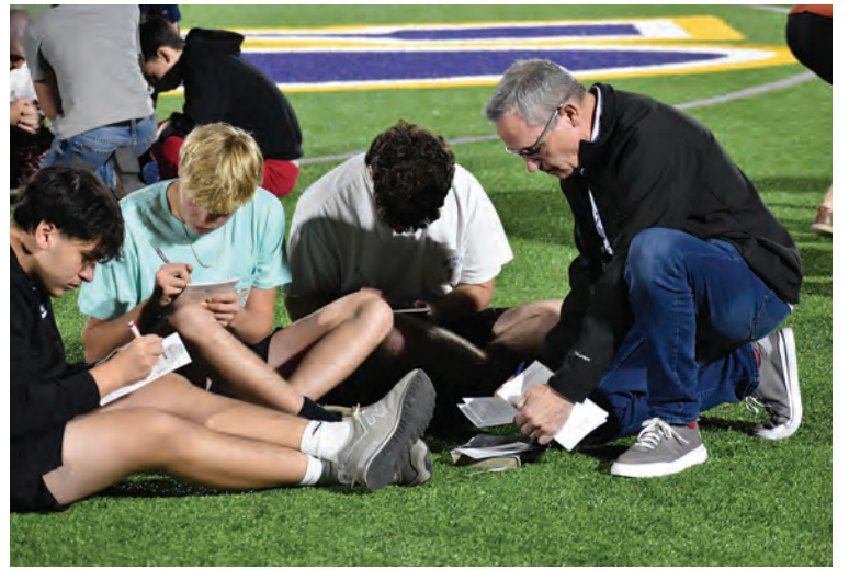
Counselors met with those who made a decision for Christ at the end of each evening of the Livingston Parish GO TELL AMERICA Crusade.

Organizers also held several events to pray,