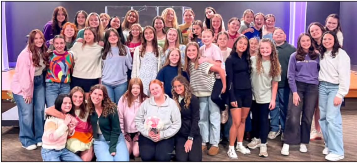
More than 50 middle and high school girls spent time celebrating the truth of John 3:16 and discussing what a believer's response is to God's love for His people at Calvary Baptist Church, Alexandria.