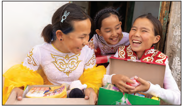
A trio of girls in Mongolia rejoiced over the shoebox gifts provided to them from Operation Christmas Child.

For those who are unable to shop for items to fill a box, the Samaritan’s Purse website