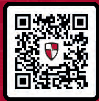
Making College Affordable