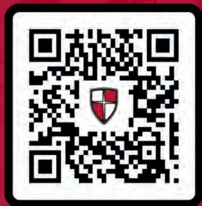
Visit the Office of Admissions

Because a Christian education should not come with hidden costs.