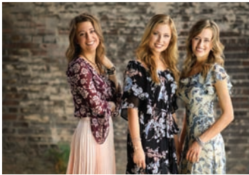
The Foto Sisters