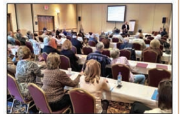
Contact us about speaking to your group!