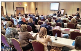
Contact us about speaking to your group!