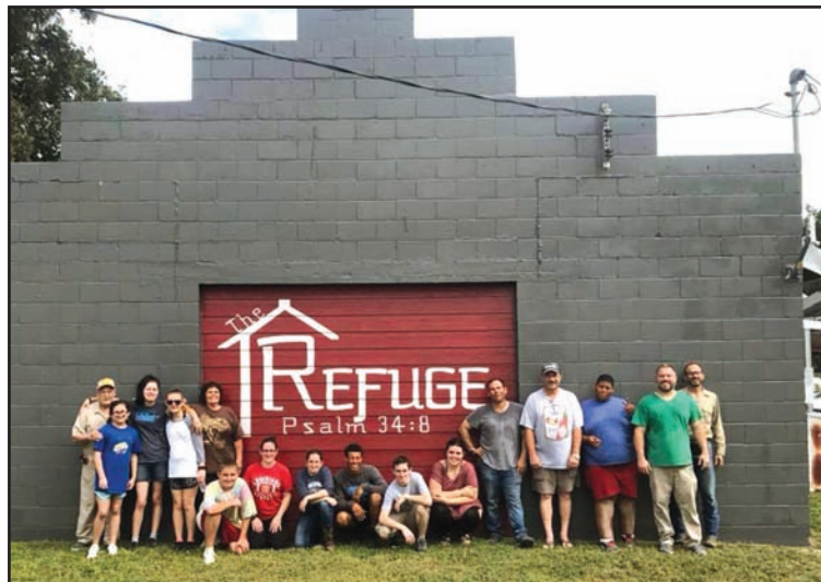
Youth and adult leaders stand outside the Refuge, which serves as a ministry hub for students. Their adopted verse is Psalm 34:8.

were having our revival. The flooding was a hard blow that took the wind out of our sails. The whole experience brought the church together during the struggles, but at the same time, it was deflating. We