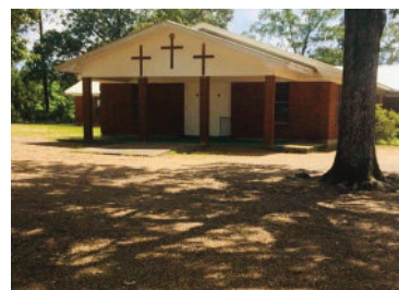
Laurel Hill Baptist Church celebrated its 150th anniversary June 22.