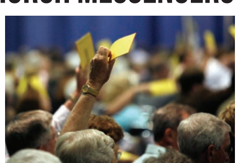
Messengers raise their ballots to cast theirvote at the SBC Annual Meeting.

Messengers elected by your congregation may also register on site by