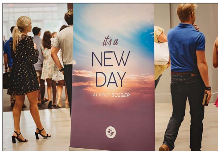
Members and guests enjoy the new rotunda, which will be a focal point for all who enter near the worship center for years to come.