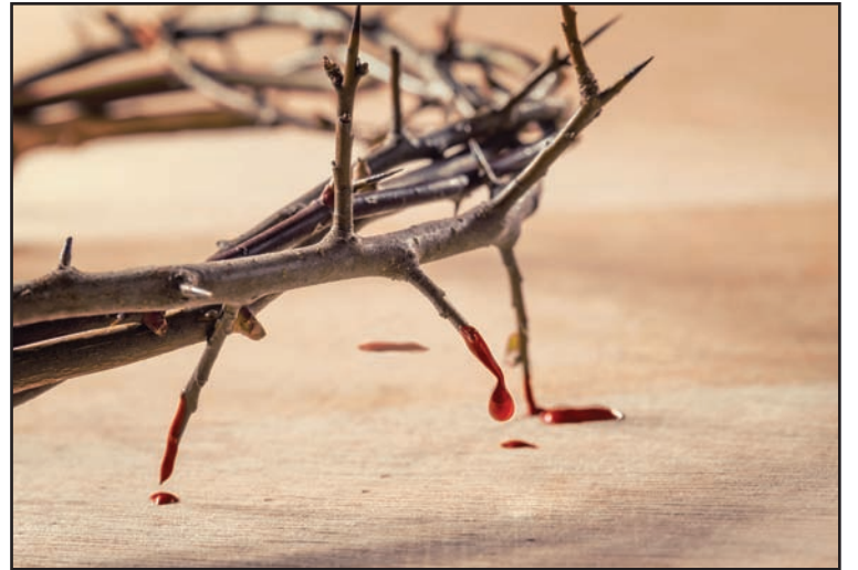
Six of the world's most noted scholars in biblical studies and Christian theology will discuss "The Meaning of the Atonement" Nov. 10-11 at the 14th annual Greer-Heard point-Counterpoint Forum at NOBTS.

The debate around atonement prompted messengers at the June 13-14, 2017 Southern Baptist Convention annual meeting in Phoenix to adopt a resolution regarding the necessity of penal substitutionary atonement. The resolution addresses voices within the church and academy that label penal substitution as "non-