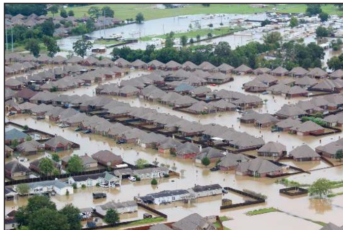
It is estimated that 40,000 to 60,000 homes across south Louisiana have been damaged or destroyed by historic and massive flooding.