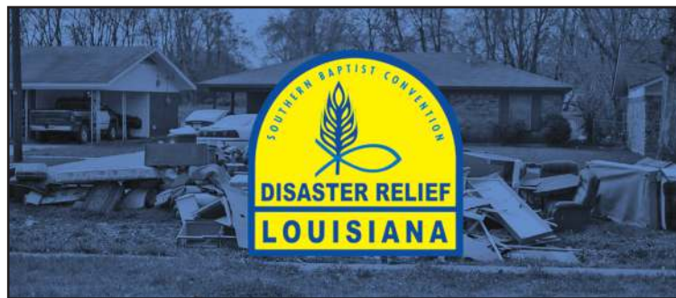
Disaster relief efforts such as the current flooding response in the state rely heavily on funds from the Georgia Barnette State Missions Offering.