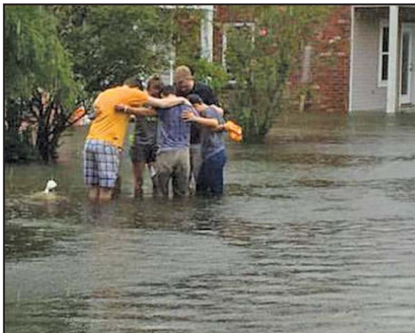
These LSU BCM students take a moment to pray in the rain as they assist people getting out of their flooded homes.