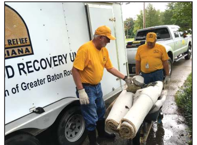
Louisiana and other Southern Baptist Disaster Relief teams have already begun the cleanup process.

Unprecedented flooding leaves thousands homeless, desperately seeking help